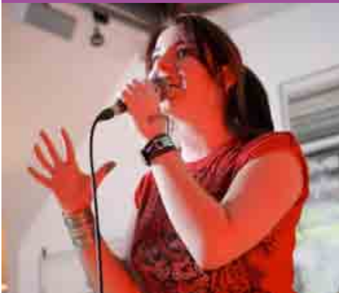
Touring and Performing Network Gig

The Scottish Music Centre in partnership with the Youth Music Initiative (YMI) has been developing the idea since late 2009 and are now engaged in the process of building a unique user driven site where members can engage and network with one another.