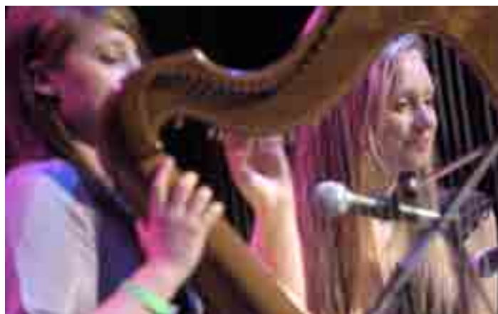
Falkirk Trad Music Project – Falkirk Council

Download the guides at: www.artspider.org.uk/resources/other_info