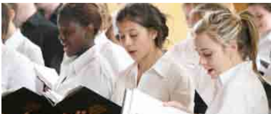
NYCoS Stirling Castle

Towards the cost of supporting young people to gain lyrical, instrumental and technical skills.